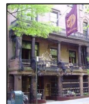
The Players—New York

More complete contact information and addresses for Reciprocal Clubs can be found in the printed edition of The Cliff Dwellers 2013 Membership Directory .