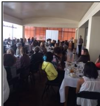
A full house for the IWD program on the Cliff.

In all, over 80 individuals attended the IWD program on the Cliff. Approximately half were students and guests sponsored by members to share a day of "great inspiration" among a host of interesting women ready to inspire, guide, and lead the next generation.