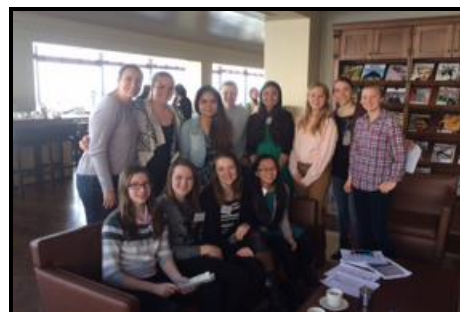
Young women from nearby schools and colleges enjoyed their day in the Kiva.